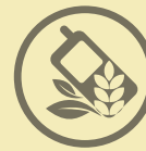
ICT In Agriculture