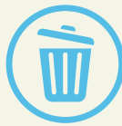
Food Losses & Waste