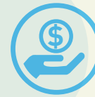
Finance & Investments