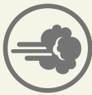
Disease & Pest Control