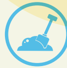
Soil & Plant Health